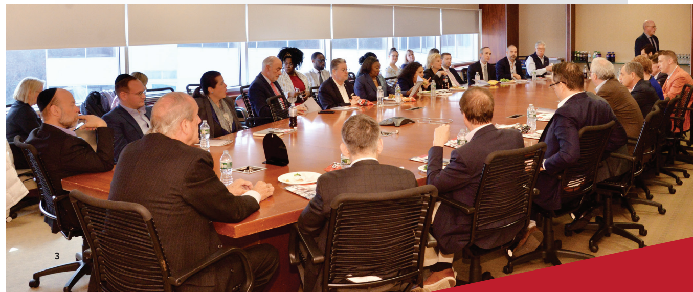
The BCW's Smart Development Working Group held its annual roundtable meeting with the members of the Westchester Senate and Assembly Delegation to discuss key budget and economic development issues.

will, in turn, create much-needed jobs in all business sectors. The BCW looks forward to continuing meaningful discussions with our county, state and federal elected officials on the many issues presented in this Legislative Agenda to ensure that the collective voice of the county's business community is heard.