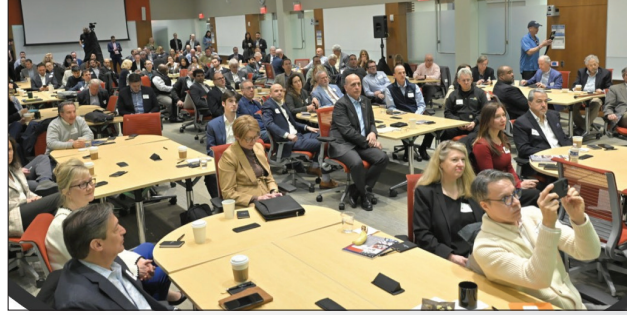
BCW 2025 Energy Conference

Therefore, the CEAC advocates that Westchester: