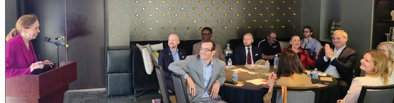
Assemblymember Amy Paulin, Chair of the Assembly Health Committee, addresses BCW members during the 2025 Albany Lobby Day.

✓ Reject the "Tax the Rich" agenda that would increase taxes for many New Yorkers. The agenda includes bills to implement: a new progressive income tax structure for high income payers; a capital gains tax; an heir's tax; a mark-to-market tax; a stock transfer tax; and additional taxes on certain business income included in an individual's taxable income.