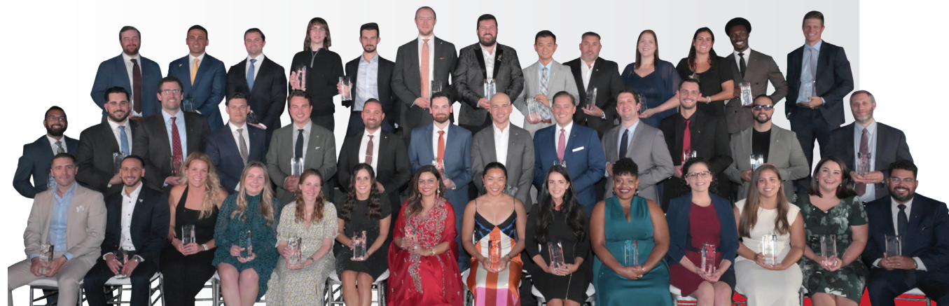
The 2025 Rising Stars class was honored by over 500 guests who attended the BCW's Rising Stars Celebration.

In 2026, the BCW's Coalition for Westchester Airport will advocate for additional and necessary enhancements to make the airport more attractive so that it can continue to play an important role in creating economic development opportunities for the county. The Coalition will remind its political leaders of the following important facts: