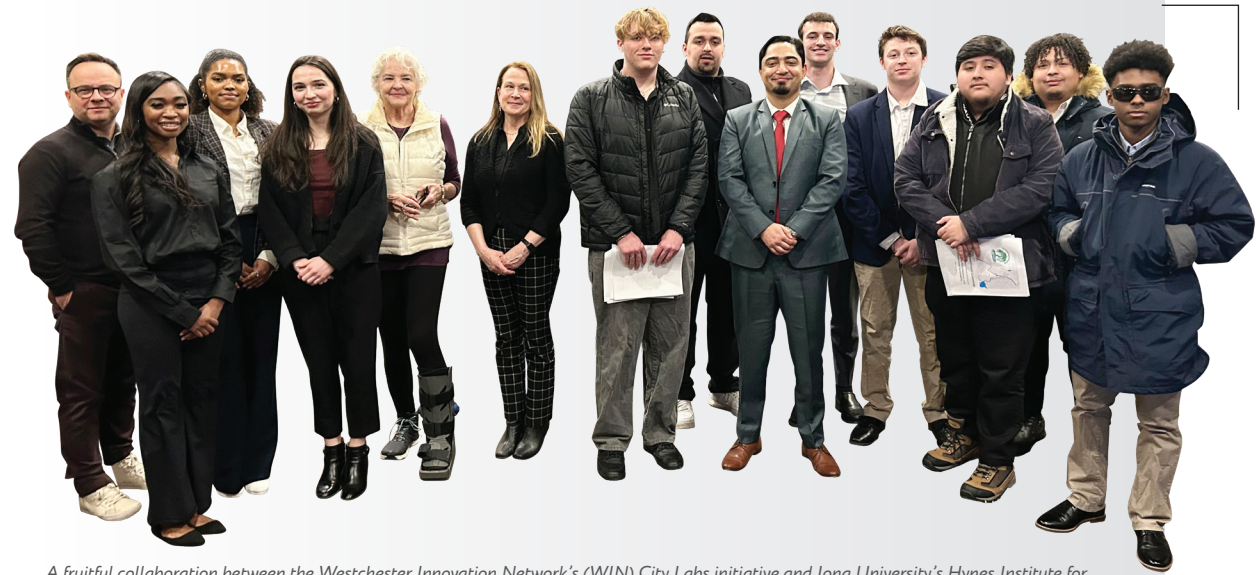
A fruitful collaboration between the Westchester Innovation Network’s (WIN) City Labs initiative and Iona University’s Hynes Institute for Entrepreneurship & Innovation culminated in the delivery of student-led recommendations to address parking challenges in the Village of Mamaroneck’s bustling downtown.