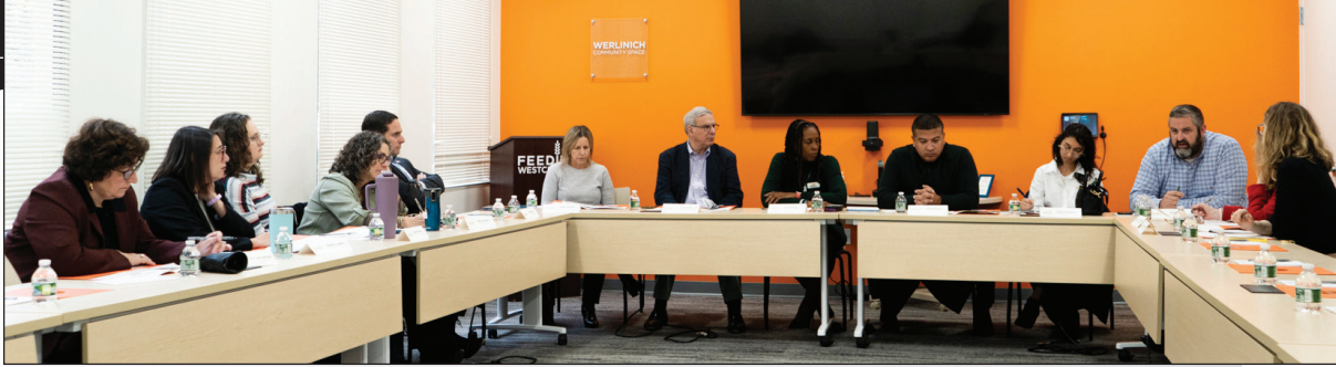
BCW facilitated a roundtable discussion with members of the State Legislative Delegation and the leadership team of BCW member Feeding Westchester to discuss critical budget issues.