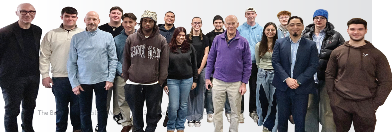
The Westchester Innovation Network’s (WIN) City Labs initiative recently delivered ideas for improving the Town of Greenburgh’s food scraps recycling program.

The BCW launched WIN in December 2021 to drive economic growth and development in Westchester County. By reaching out to cutting-edge companies within Westchester and outside of the region and partnering with them, WIN’s goal is to integrate more innovation into our local businesses and municipalities.