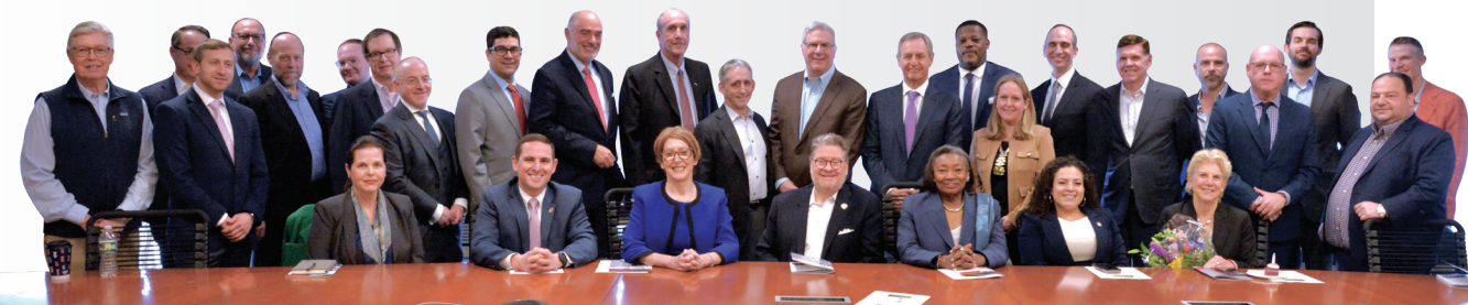
The BCW's Smart Development Working Group's Annual Meeting with members of the Westchester State Delegation.