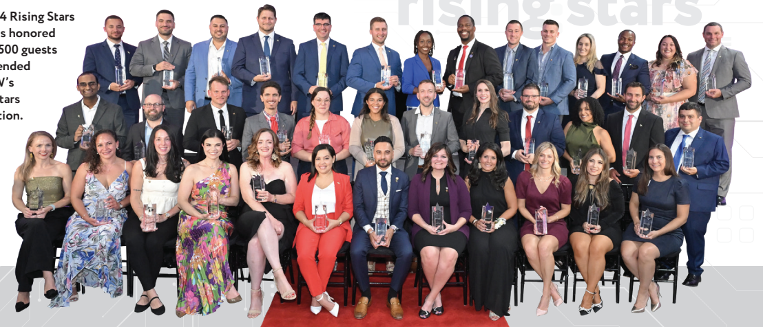
The 2024 Rising Stars class was honored by over 500 guests who attended the BCW's Rising Stars Celebration.