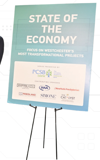
2025 Legislative Agenda