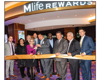
Empire City Casino celebrates the arrival of MGM Resorts' Mlife Rewards program to the country's sixth largest gaming floor.

Each year New Yorkers statewide directly benefit from the more than $300 million Empire City generates for state education.