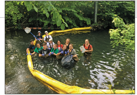
Westchester Parks Foundation's Clean River Project, sponsored by Entergy, in the Bronx River in White Plains.

Improving and investing in Westchester's clean water infrastructure projects is a top priority of the BCW.