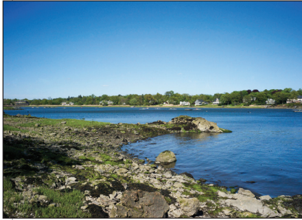
ABOVE Marshlands Nature Preserve.