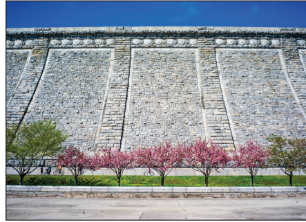
ABOVE RIGHT Kensico Dam Plaza.