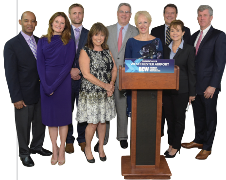
Members of the BCW's Coalition for Westchester Airport.